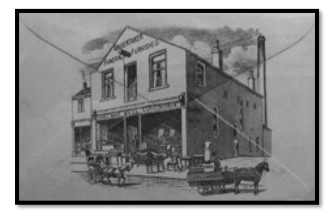
Beautifully printed rear of envelope from T Rhys, funeral directors

Starting with the funeral business itself, the survivor choosing the coffin, the lining, the furniture, the type of funeral, the stationery, the advices and notifications, undertaker advertising, settling the bills, the types of service, wills, and many other forms of paperwork involved. Types of death from disease, murder, execution and terrorism were explored. The use of coffins for smuggling; death certificates, re-internments, memorial design, war deaths on land and sea were all illustrated. The use of the black borders and homemade stationery were all covered, as was the use of black seals and black wafers. Truly, a unique display and one all the audience thoroughly enjoyed and learned so much from.